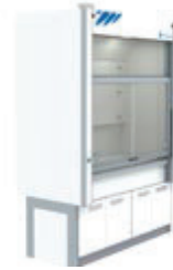
1. BECOME ST