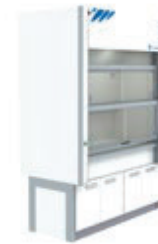
2. BECOME ST Low