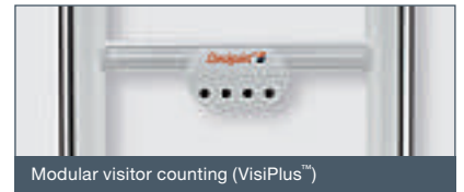
Modular visitor counting (VisiPlus™)

A wide range of accessories, such as advertising panels, safety panels, bumper posts with deflectors, external shields and modular visitor counting (VisiPlus™), are available for use with the EVOLVE P antennas.